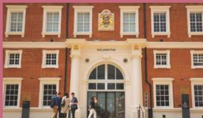
GOLDSMITHS University of London

Eye-opening and informative, the trip to Goldsmith's University was a great experience for both staff and pupils. We were given a tour around the university grounds and provided with a smorgasbord of refreshments, courtesy of our hospitable Goldsmith's ambassadors. Along with the campus tour, our Trinitarians were tasked to complete a fact-finding sheet, which they sought to fill out as they gathered new information about the university. The friendly-competitive nature of the activity certainly roused the competitive spirits of many, as it was a competition of which group could complete the sheet first, within the allocated time frame. A remarkable close to the day, the final session provided a taster on the philosophical underpinnings behind advertisement, allowing many of our histrionic pupils to display their creative flair and passion for drama. Thank you, GU Ambassadors, for making the day an exciting, educational and memorable experience.'