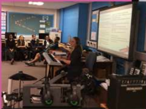
Singing for mental health

Year 9 worked with the group Straight Talkin on relationship education. They worked in teams and discussed issues such as teenage pregnancy and child sexual exploitation.