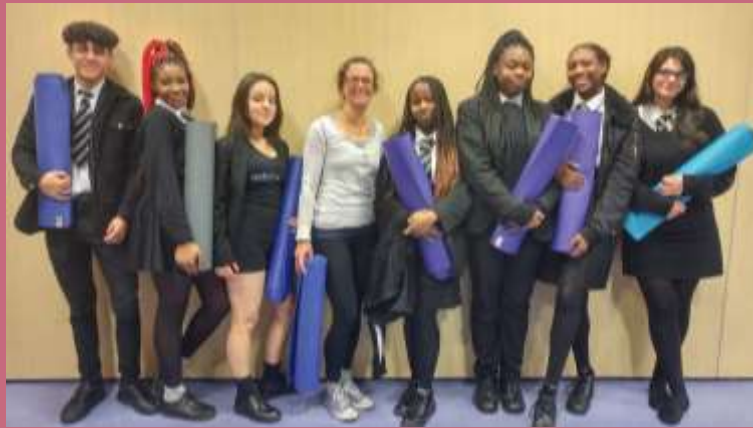
Y11 Yoga class

https://childlightyoga.com/research-supports-yoga-mindfulness-in-schools-info